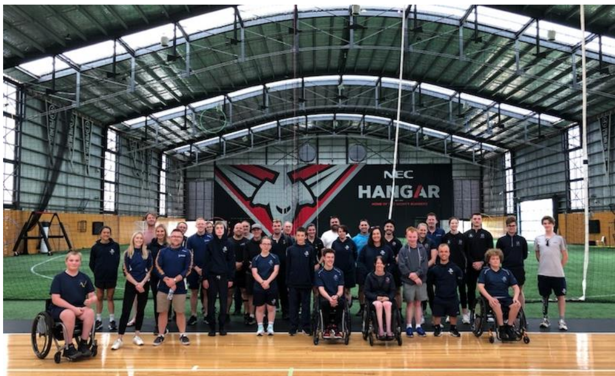
Image 2: Induction Session at the NEC Hangar (Essendon Football Club), February 2023

^ Please note: Talent potential refers to an Emerging or Developing level athlete, or a pre-categorised athlete that has the potential to progress to Emerging/Developing level categorisation within two years (factors such as current age, training age, projected development and classification may be considered to determine 'talent potential' through the NSO/SSO and Paralympics Australia).